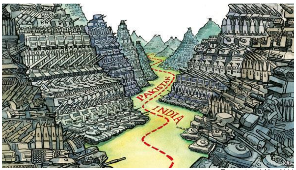
Economist, 19 May 2011

A recent cartoon in the Economist might be useful in classroom discussions on India's foreign policy (Paper 1 Theme 4) and the Jammu-Kashmir dispute (Paper 2 Case Study 3).