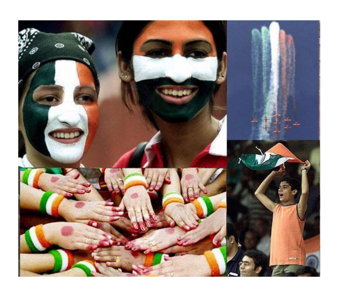
Cambridge IGCSE India Studies Newsletter 14 August 2011